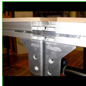
The MFT connectors fit the "T" slots around the perimeter of the MFT